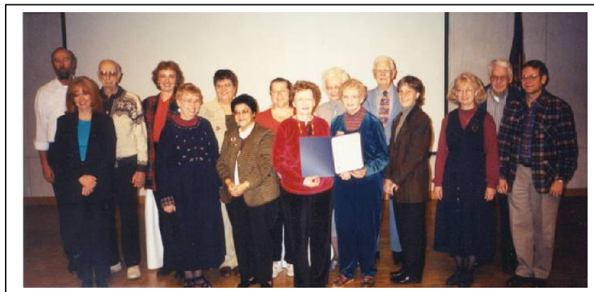
Attending the National Register Awards Ceremony from left: